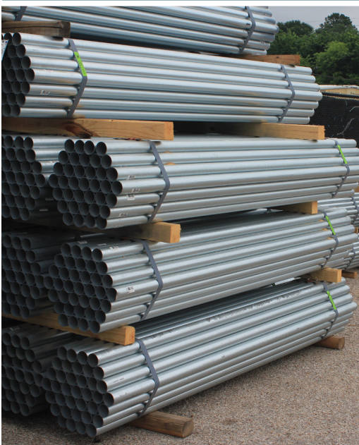
WALL THICKNESS OF GALVANIZED FRAMEWORK

Matching galvanized steel framework is available in a variety of gauge and diameter sizes, for 3' to 12' high chain link fence systems.